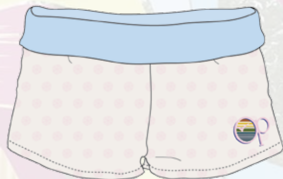
snowflake ditz boxer_white 100% COTTON PRINTED FLANNEL 64x66 32x20 BRUSHED 3x OUT 2x IN