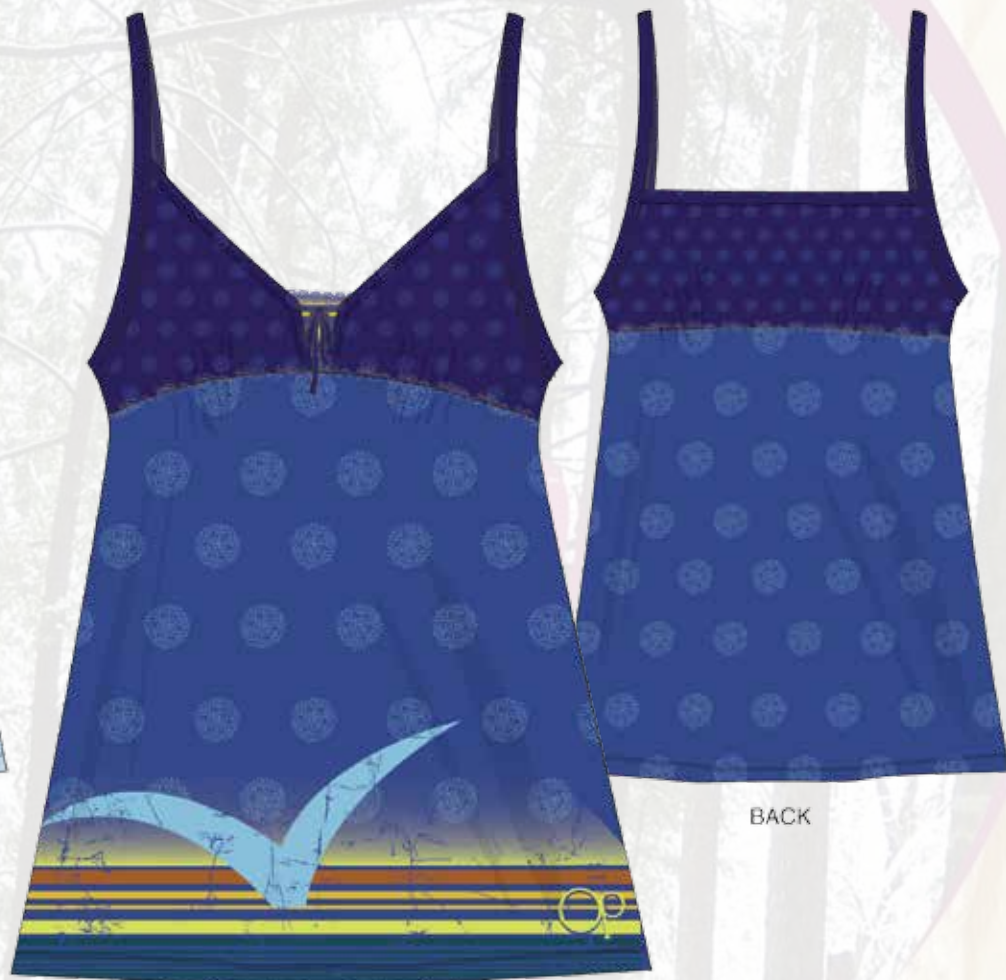
bird sunset lace pieced babydoll_blue JERSEY 60% COTTON/ 40% POLY