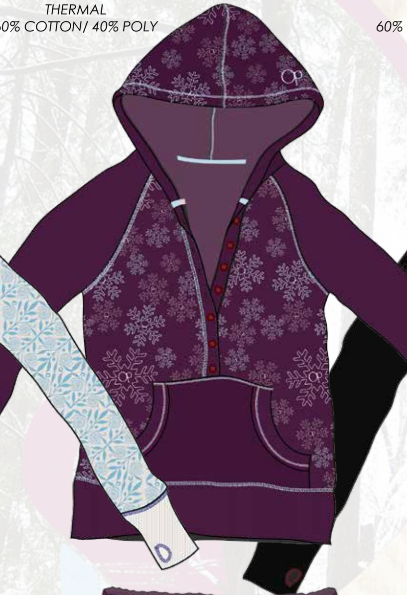
snow OP flake henley hoodie THERMAL 60% COTTON/ 40% POLY