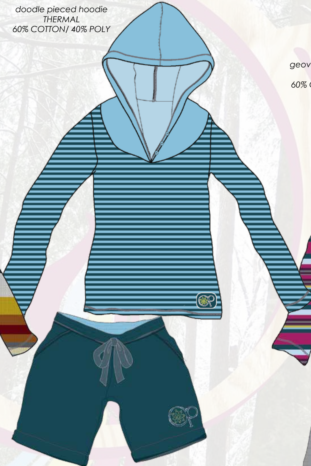
doodle walking short INSIDE BRUSHED FLEECE 58% COTTON/ 39% POLY/ 3% SPANDEX