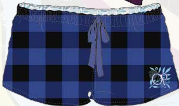
buffalo check boxer 100% COTTON PRINTED FLANNEL 64x66 32x20 BRUSHED 3x OUT 2x IN