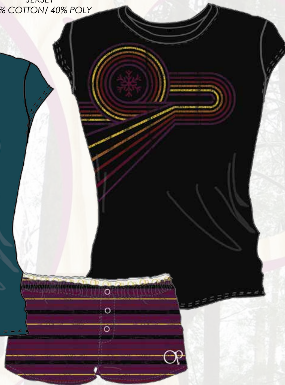
op tick boxer 4 WAY STRETCH 95/5 COTTON/ SPANDEX 4 WAY STRETCH