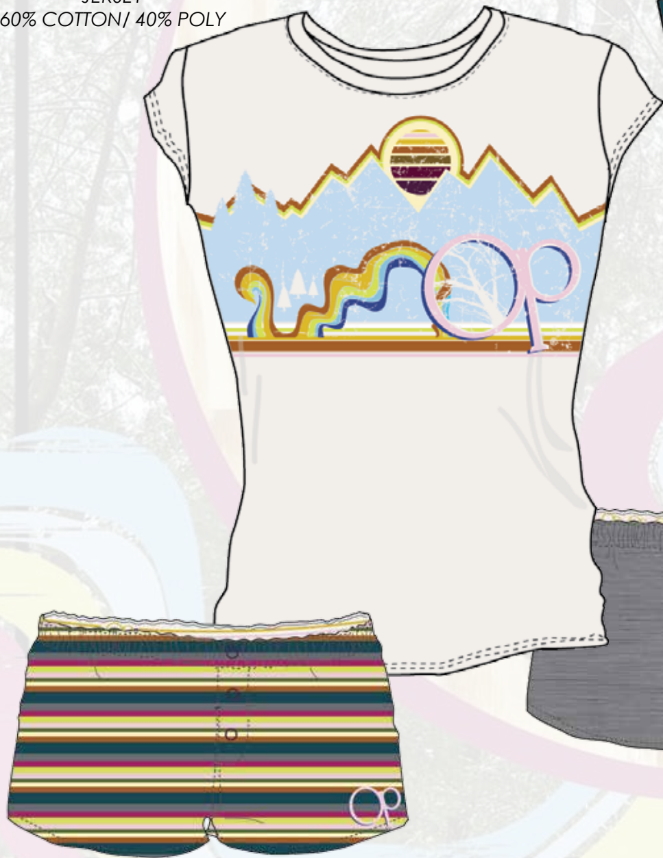
mountain stripe boxer 4 WAY STRETCH 95/5 COTTON/ SPANDEX 4 WAY STRETCH