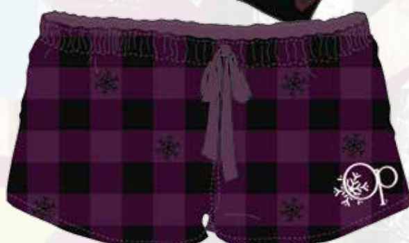
snow check boxer 100% COTTON PRINTED FLANNEL 64x66 32x20 BRUSHED 3x OUT 2x IN