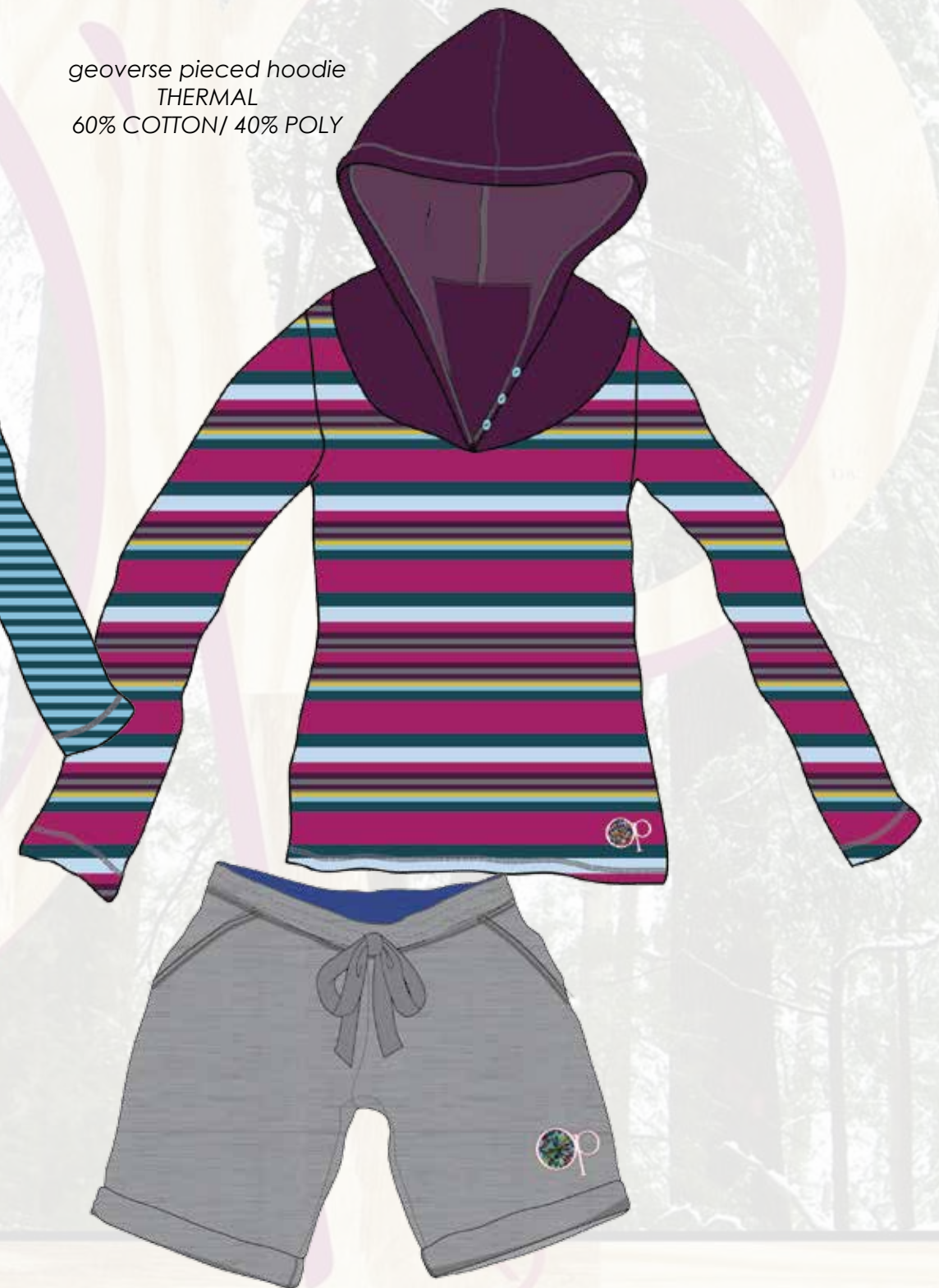
geoverse walking short INSIDE BRUSHED FLEECE 58% COTTON/ 39% POLY/ 3% SPANDEX