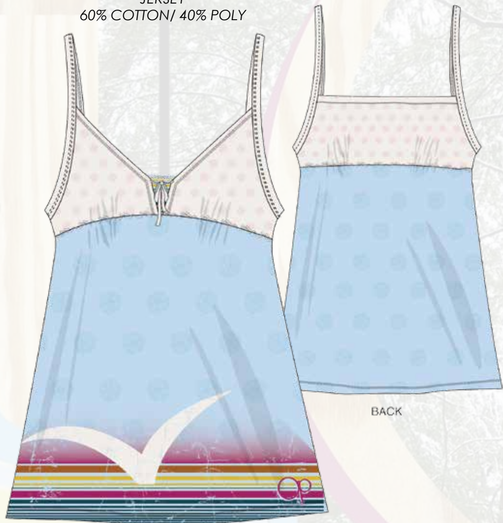
bird sunset lace pieced babydoll_white JERSEY 60% COTTON/ 40% POLY