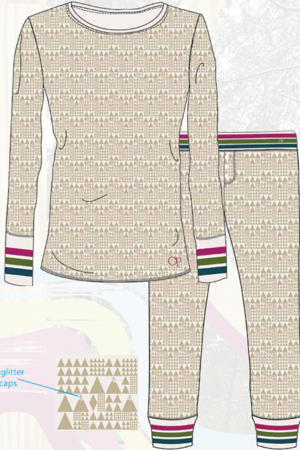
ditsy mountain top legging THERMAL 54% COTTON/ 44% POLY/ 2% SPANDEX 180 GMS