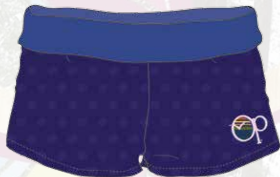
snowflake ditz boxer 100% COTTON PRINTED FLANNEL 64x66 32x20 BRUSHED 3x OUT 2x IN