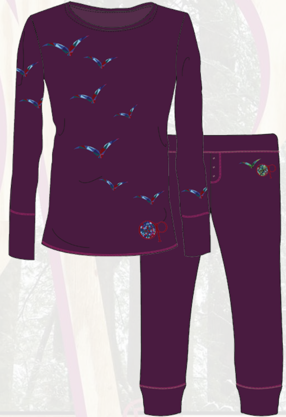
geoverse legging THERMAL 54% COTTON/ 44% POLY/ 2% SPANDEX 180 GMS