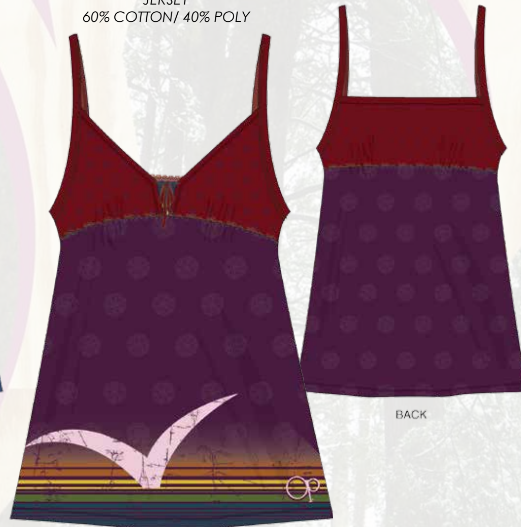
bird sunset lace pieced babydoll_plum JERSEY 60% COTTON/ 40% POLY