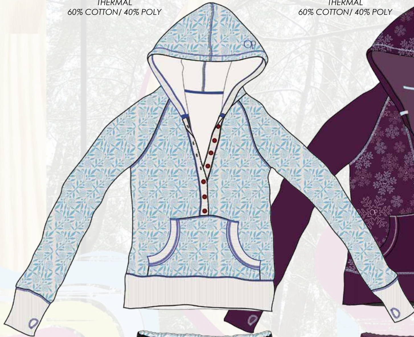
snow OP flake henley hoodie THERMAL 60% COTTON/ 40% POLY