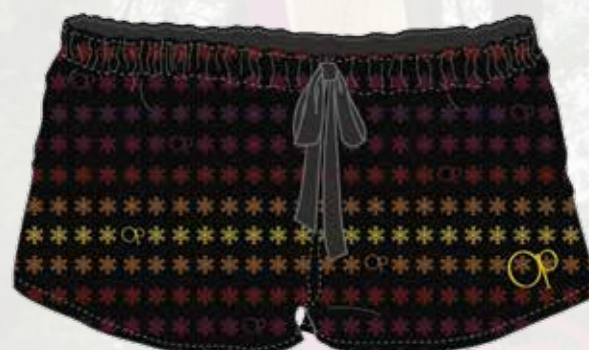
snow stripe boxer 100% COTTON PRINTED FLANNEL 64x66 32x20 BRUSHED 3x OUT 2x IN