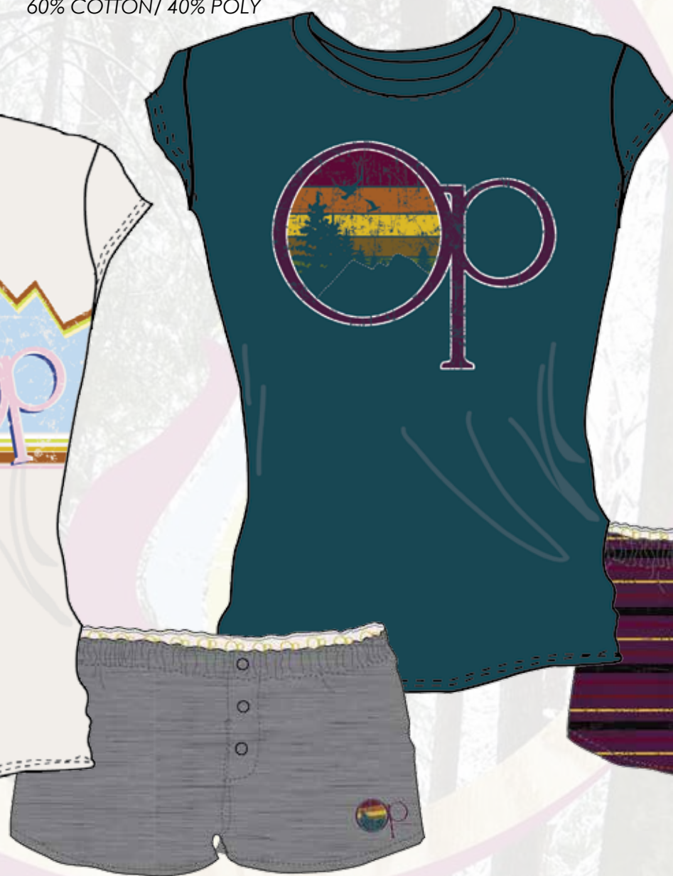
golden mountainer boxer 4 WAY STRETCH 95/5 COTTON/ SPANDEX 4 WAY STRETCH