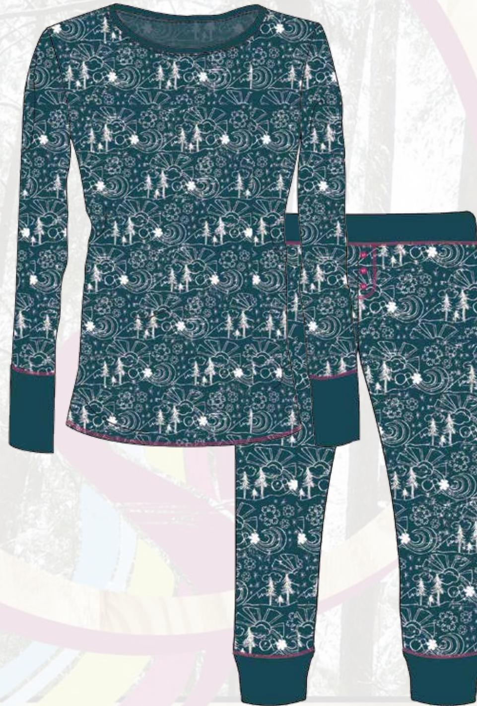
doodle mountain legging THERMAL 54% COTTON/ 44% POLY/ 2% SPANDEX 180 GMS