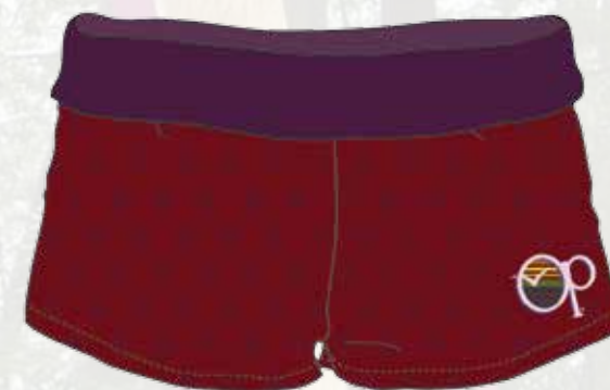
snowflake ditz boxer 100% COTTON PRINTED FLANNEL 64x66 32x20 BRUSHED 3x OUT 2x IN